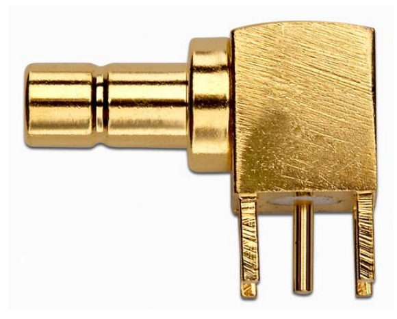
Model 72998 SMB JACK R/A PCB RECEPTACLE